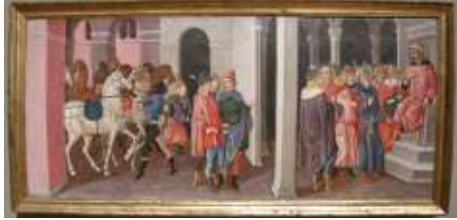
The Magi Before Herod Matteo di Giovanni

https://useum.org/artwork/The-Magi-Before-Herod-Matteo-di-Giovanni