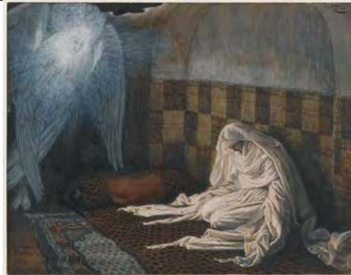
The Annunciation ( L'annonciation )