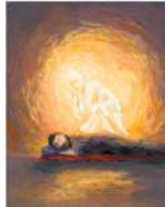
The Angel Visits Joseph Mike Moyers

https://www.mikemoyersfineart.com/product-page/the-angel-visits-joseph