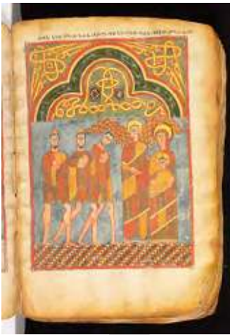
Adoration of the Magi page from Illuminated Gospel, 14 th /15 th Century

In the Metropolitan Museum of Art, New York